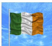
This is the Irish flag.