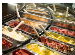
I like Italian ice-cream.