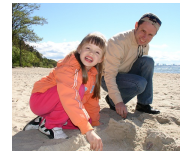
The weather today is better than yesterday. We often have the best weather in September.