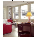
My apartment is more modern than my house.