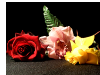
The pink flower is the prettiest .