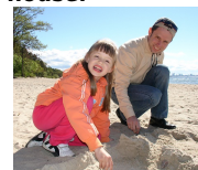
The weather today is better than yesterday. We often have the best weather in September.