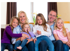
They have four daughters. The oldest is nine and the youngest is one.