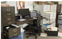
I have the worst office in the department!