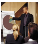
Quality is more important than price.