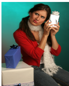
This box is smaller and heavier than the blue box.