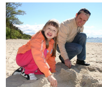
The weather today is better than yesterday. We often have the best weather in September.