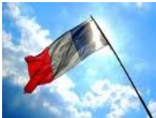
Were your visitors Swiss? No they weren't , they were French.