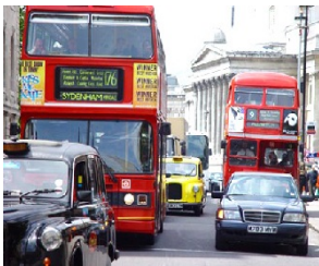
There was a lot of traffic in London last night