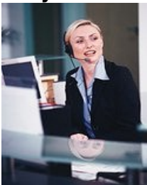
She's at the reception desk.