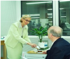
They're in an office.