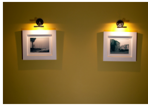
The pictures are on the wall.