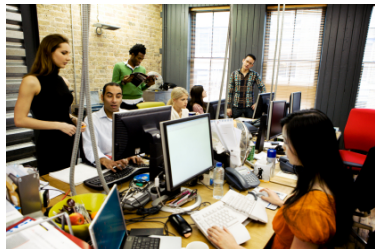
They're at work.