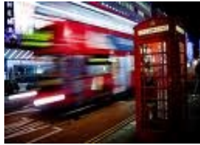
She's in London.