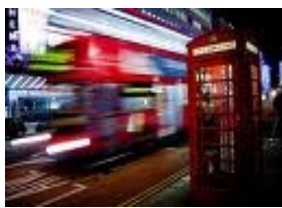
She's in London.