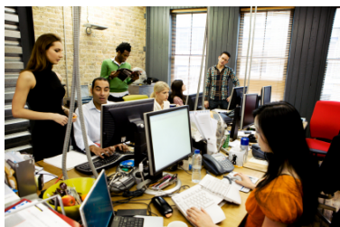
They're at work.