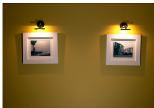
The pictures are on the wall.