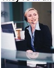
She's at the reception desk.