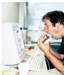
He's eating a hamburger.